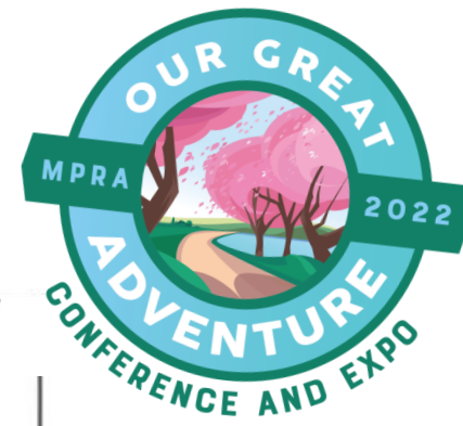
EXHIBIT HALL LAYOUT